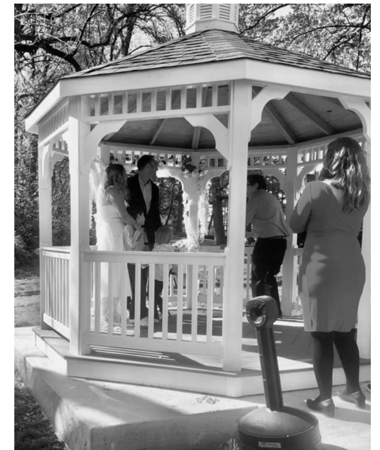
A spontaneous wedding celebration during the Covid lockdown.

It was a glorious and memorable occasion, and the couple will have a wonderful memory to tell to their children and grandchildren.