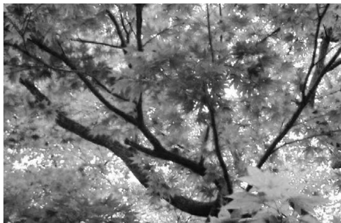
One of the many Red Maples that adorn Brookdale.

Now, one more question to leave you with. Or rather an activity. Now that you know what these trees look like, how many can you spot? I was quite surprised at how many trees I could find on 49th & 48th street on the other side of Western. There are many in Brookdale too.