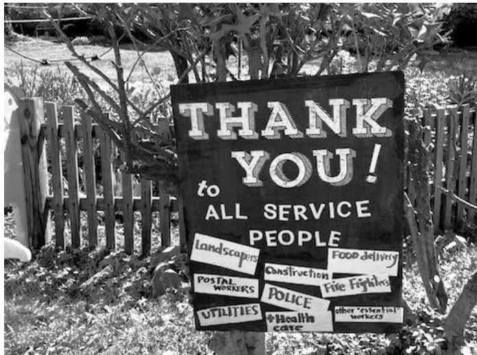
A well-deserved sign to all those who serve the neighborhood.