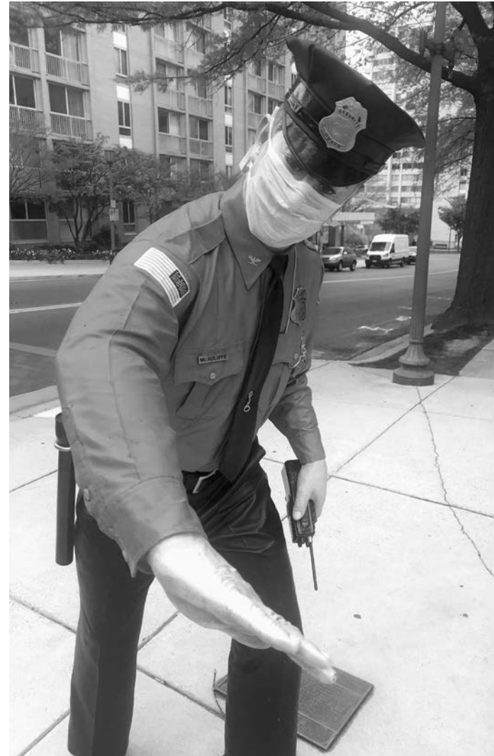
Even our permanent policeman on South Park wears a mask!