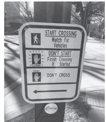
by Dick Podolske