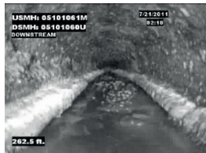
The damage fat, oil and grease inflict on sewer pipes.