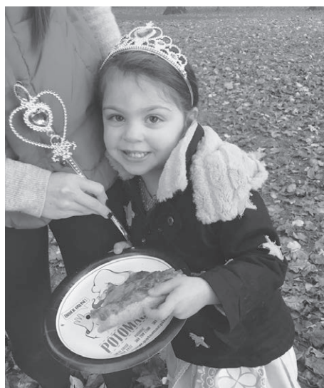
The Princesses of Brookdale

Thanks to over 25% of Brookdale families who already have paid their new $40 dues in the first quarter of 2020! I personally appreciate so many folks checking with me on the status of their dues--and I welcome any more questions as well. Certainly this is a sound endorsement in the first quarter for the work of the Brookdale Citizens Association (BCA). Our Brookdale-at-Home events continue, as do our traffic safety initiatives, local government advocacy, and our planning for other community events such as block parties.