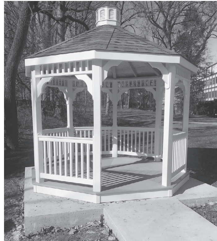
GEICO's new gazebo/smoker.