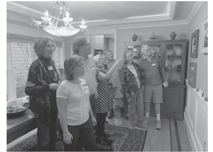
Enjoying their neighbors' talents.

It was fun to be part of this event and everyone loved the casual nature of the art walk, moving from house to house and meeting up with friends and neighbors.