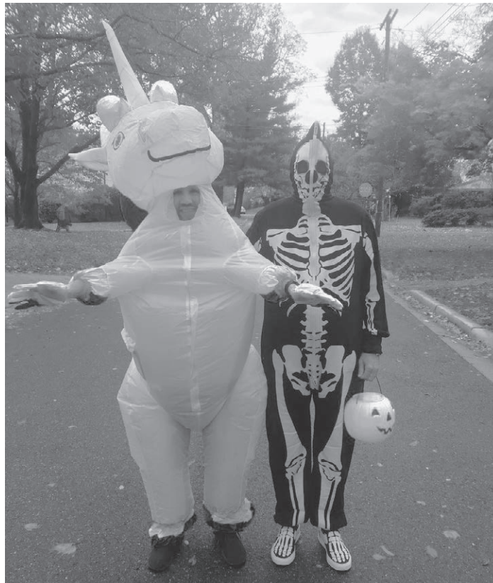
Fun was had by all!