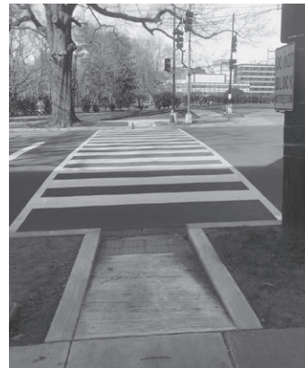
The new crosswalk at Western & GEICO.