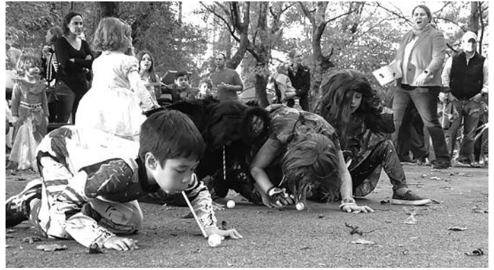
Blow the Eyeball contest