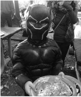
Pizza anyone?