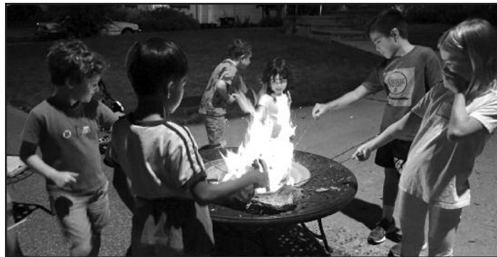
Who doesn't enjoy a toasted marshmallow?