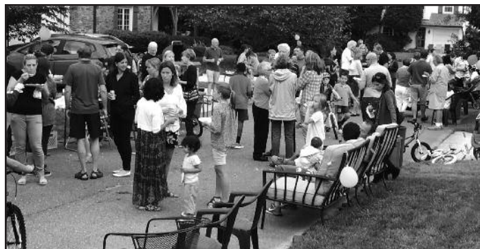
Fall Brookdale Block Party