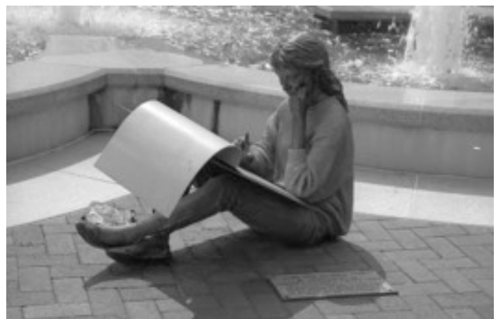
"When Now Becomes Then".