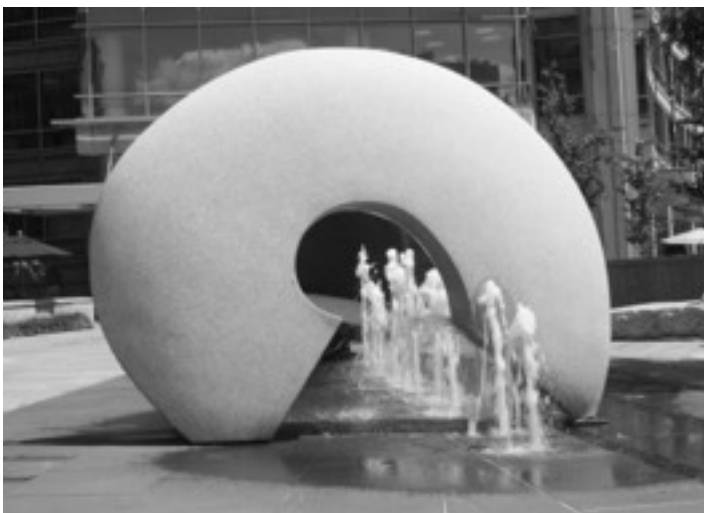
Johnston Park.