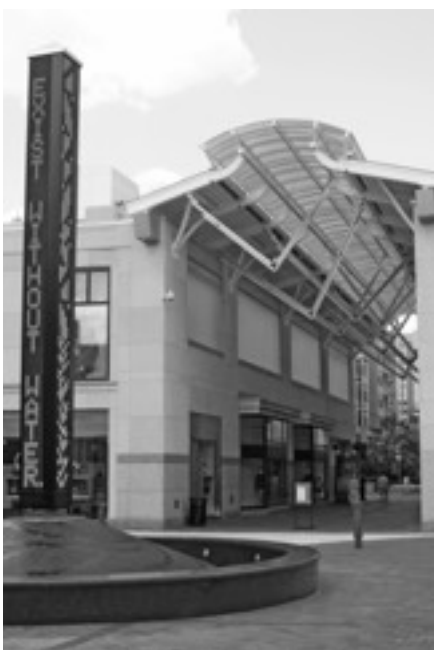
“Light Obelisk Fountain”