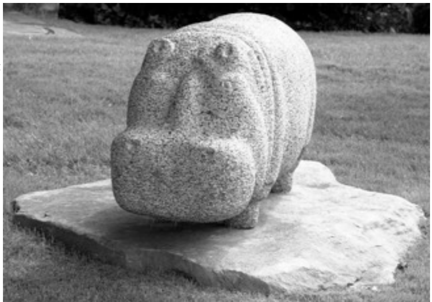
Your friendly neighborhood hippopotamus.