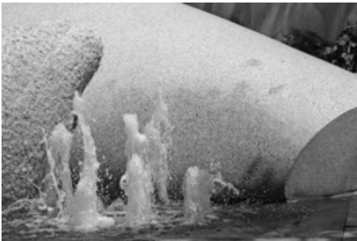
Farr Park.