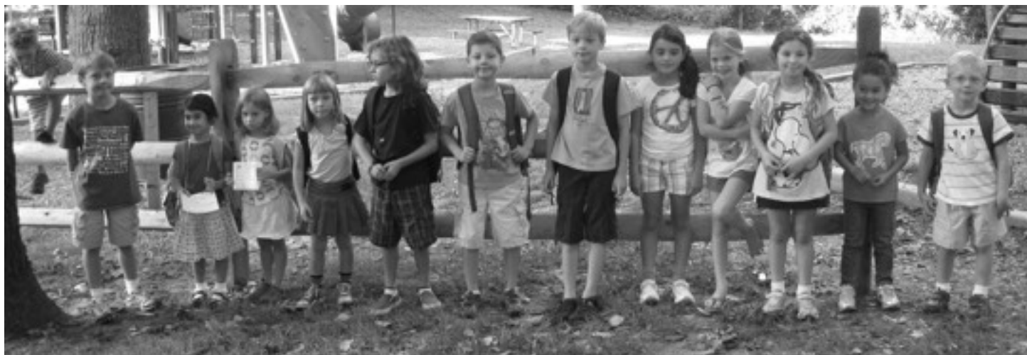
Neighborhood kids headed to Westbrook on the first day of school.