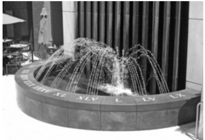
The water clock.

Continue up Park Avenue to Wisconsin Avenue. Another commercial sculpture, this one of Atlas holding the world, is visible over the door to Tiffany's. According to the store manager, variations on this sculpture are provided to Tiffany's well-located urban stores. Atlas