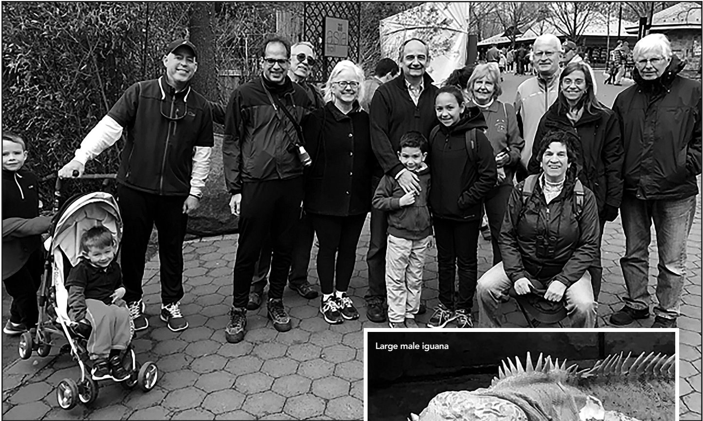
The National Zoo tour